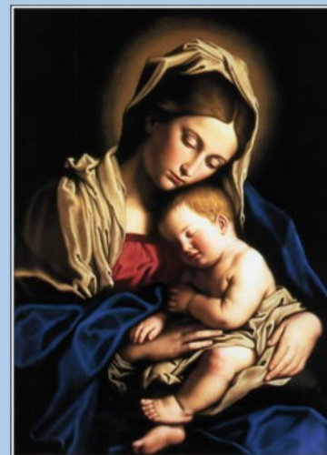
Holy Day of Obligation