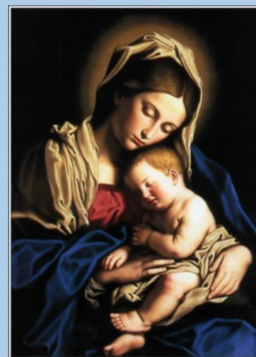
Holy Day of Obligation

Solemnity of Mary Mother of God Mass on Tues, Dec. 31st at 4:30 pm